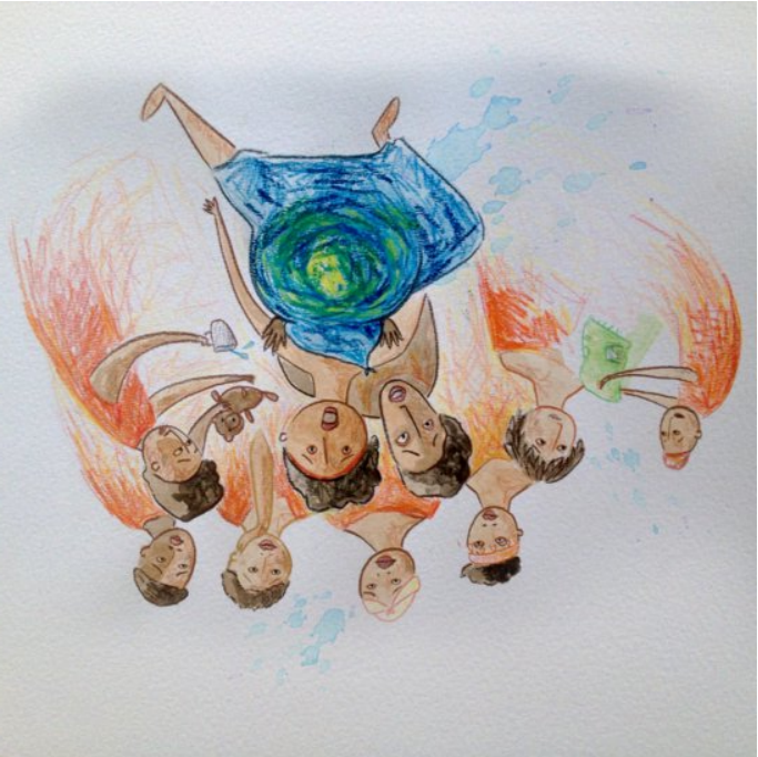
Ngabo lobo busuku wezwakala