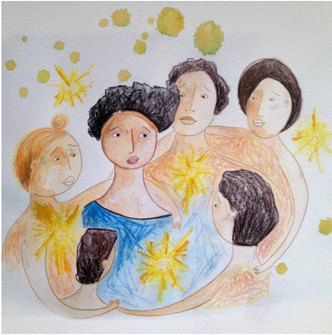
Umphakathi wamamukela ukuthi