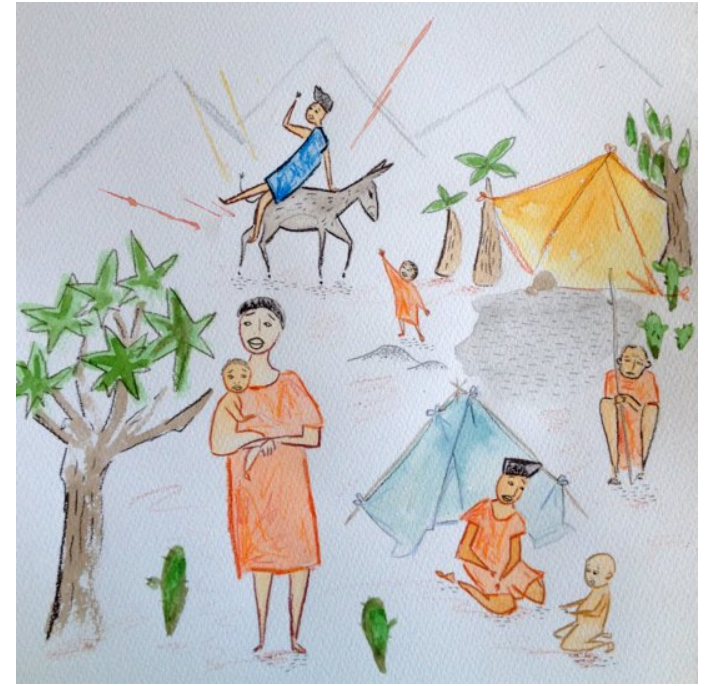
Wamthola umama wakhe, bahlala kahle ndawonye. Lapho umama wayegibela kumntwana wakhe bazulazule endaweni yangakubo.