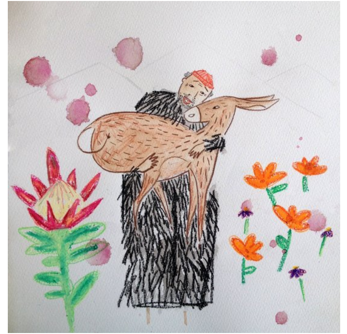
Indoda yamthatha umbongolo