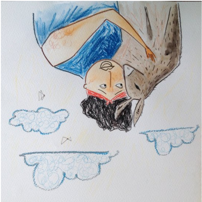
Ekugcineni wazibophezela ukumthanda