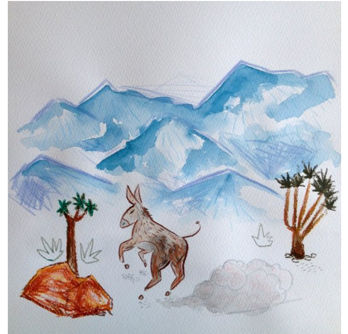
Umbongolo wayekhathazekile. Waphindela