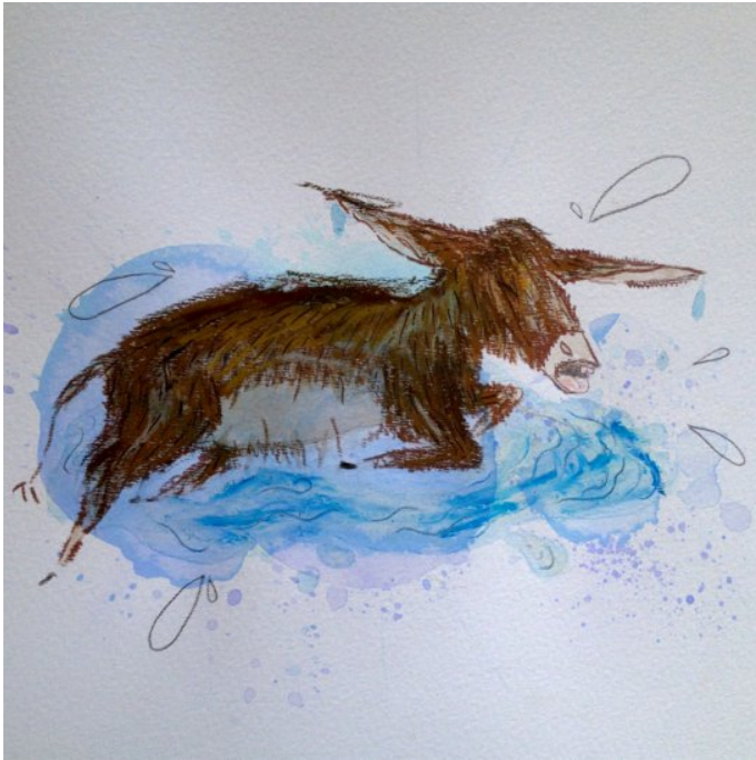
Wabeletha umntwana oyimbongolo.