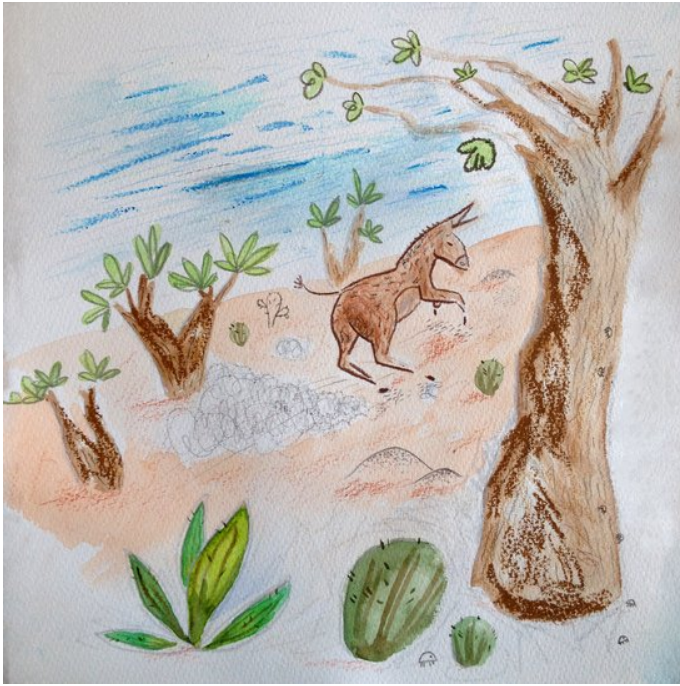
Umntwana umbongolo wabaleka