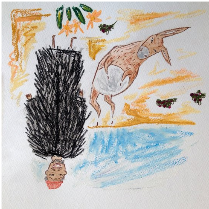
Waphaphama sekumi indoda