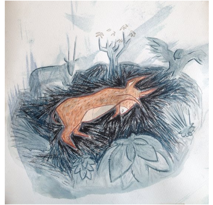
Umbongolo wazizwa enomzwangedwa, elambile futhi ekhathele. Wagcina ezumekile.