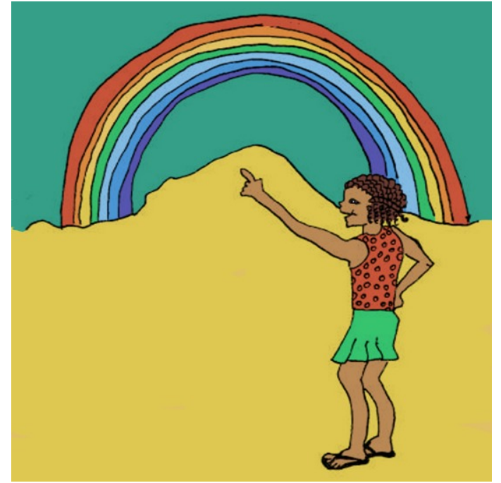
Mina bi wangu.