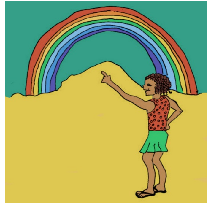
Kuli uta waleza.