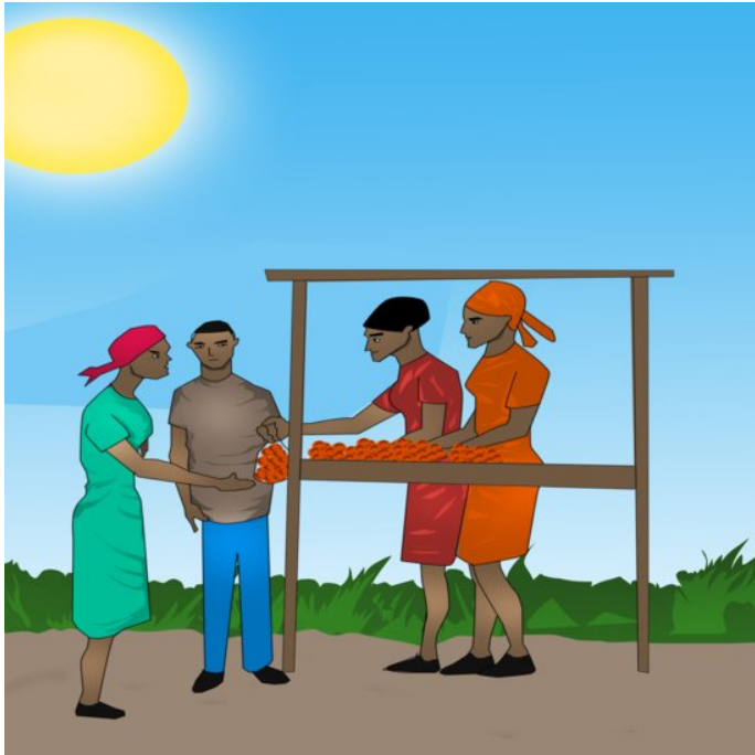
Ema sira iha merkadu sosa dadaun ai-fuan sira.