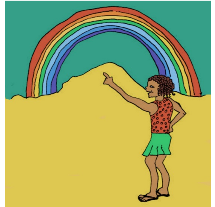
Naona upinde wa mvua.