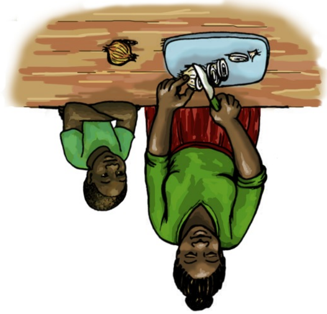
Hooyaday waxay jarjartaa basasha.