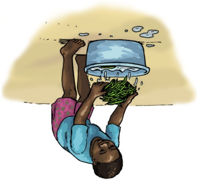
Waxaan dhagaa digirta.