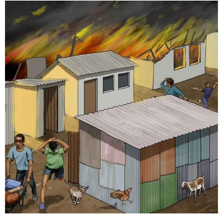
Wa a yeke kota ye.