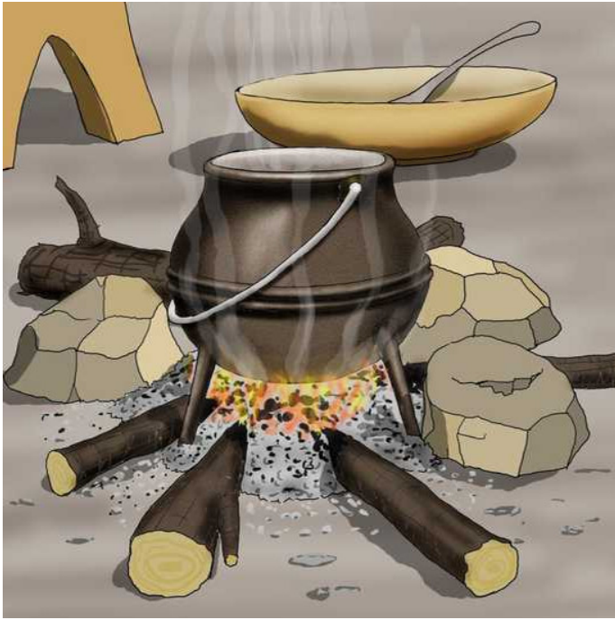
Wa a mu ye.