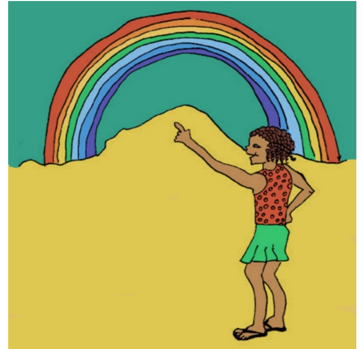
Ani sabbata waqaab argee.