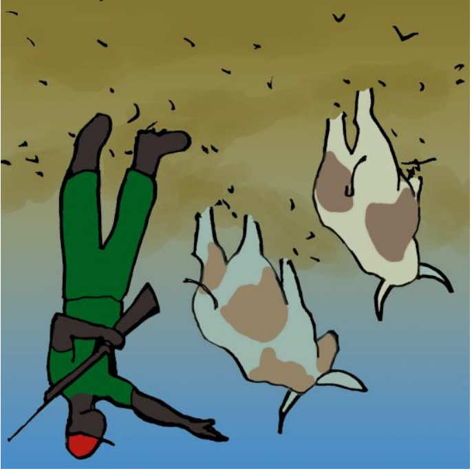
Rayaan sun saawan fudhatan.