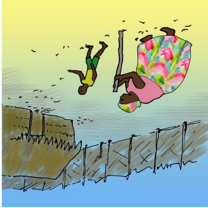
Dafani loo'an gara manaa galan.