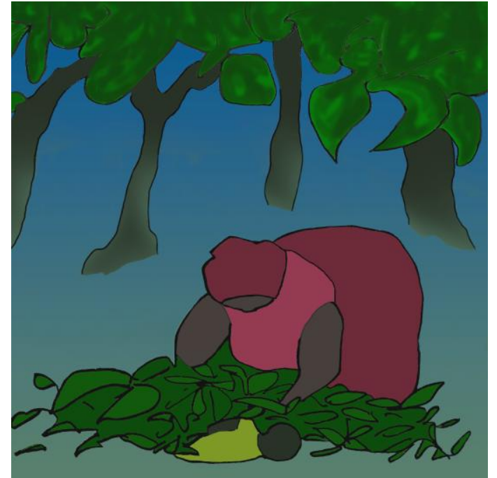
Akkoon Tinigii baala mukaa jala dhoksite.