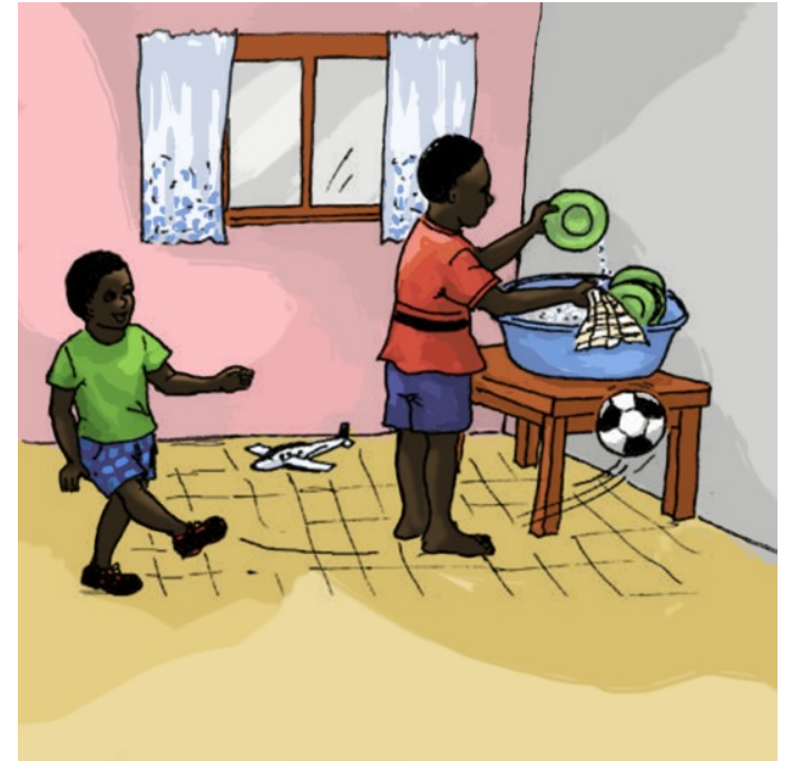
Meshaan nyaatan dhiqa.