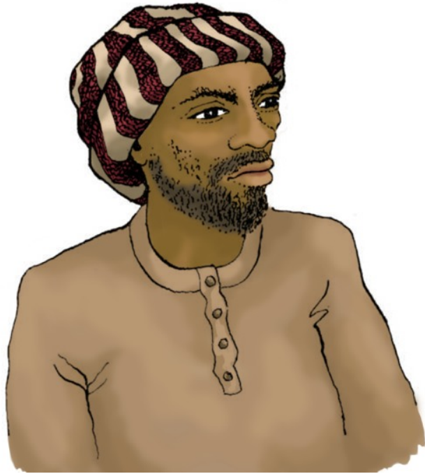
Babaan refeensa hareeda qaba.