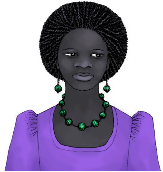
Zaanaleen refeensa ishee filaateera.