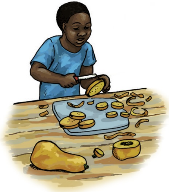
ani fuduraan cira.