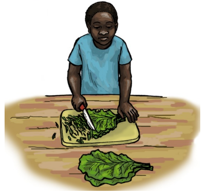
Ani espanachin cira.