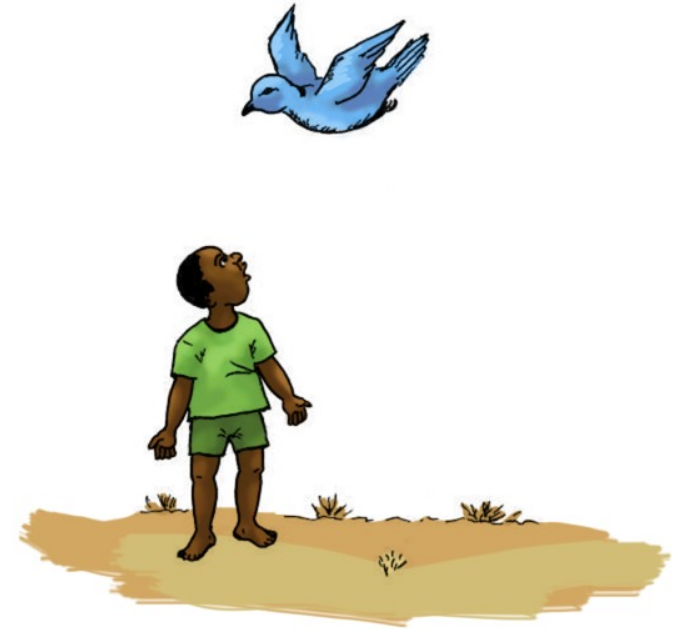
Koma siningauluke nalo.