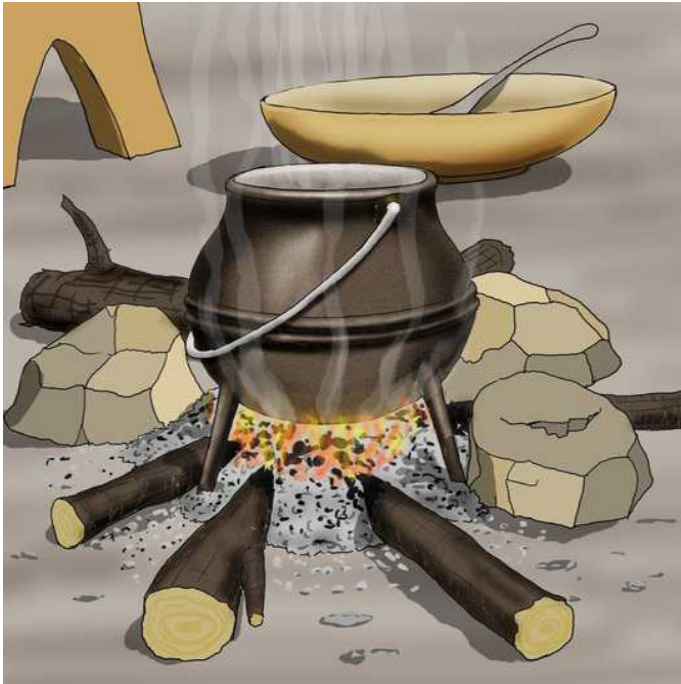
Manamasaka ny afo.