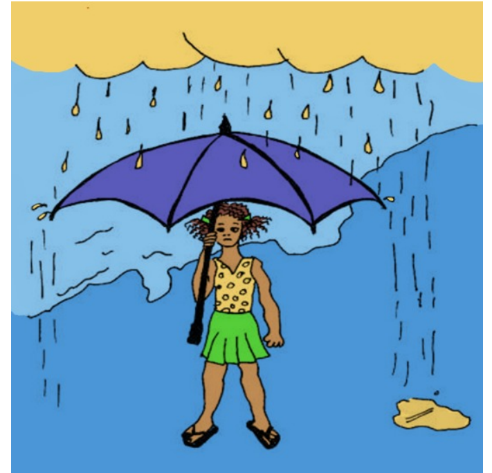
Manorana ny andro.