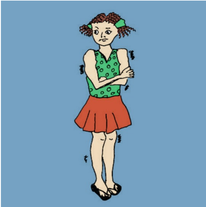
Mangatsiaka ny andro.