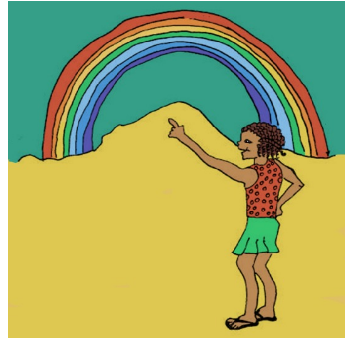
Mahita havana aho.