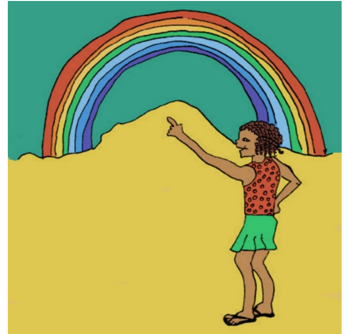
Mo trov enn larkansiel.