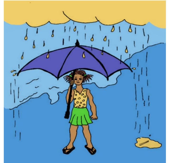
Lapli pe tonbe.