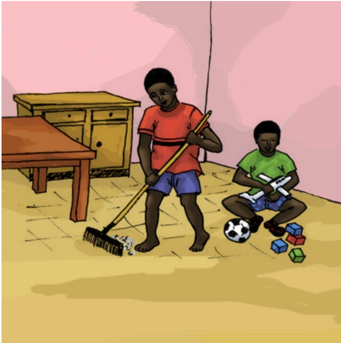
Mo pas balie.