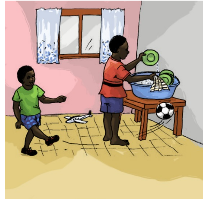
Mo lav lasiet.