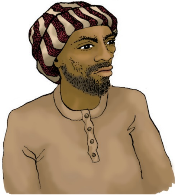
Baba ena labarb.