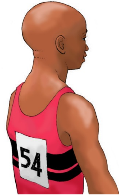
Themba finn raz so latet.