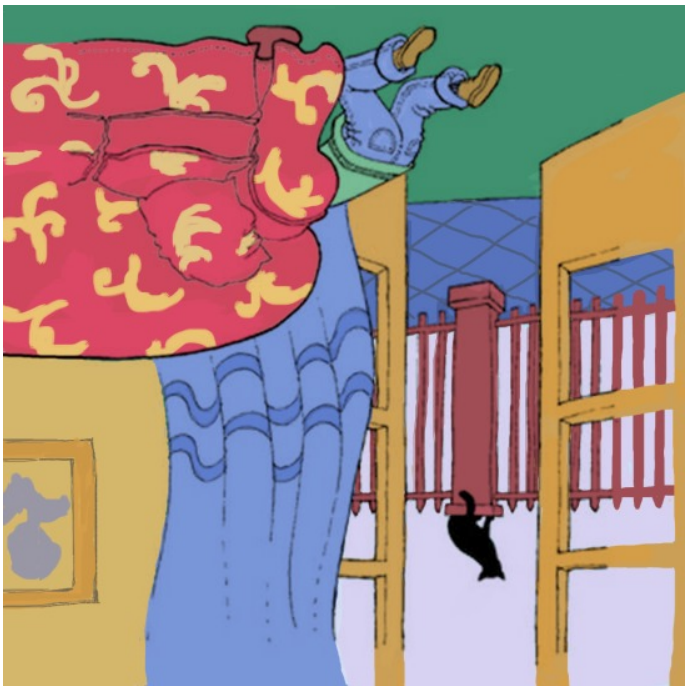
Eski li deryer sofa?