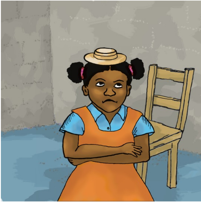
Sa sapo-la tipti.