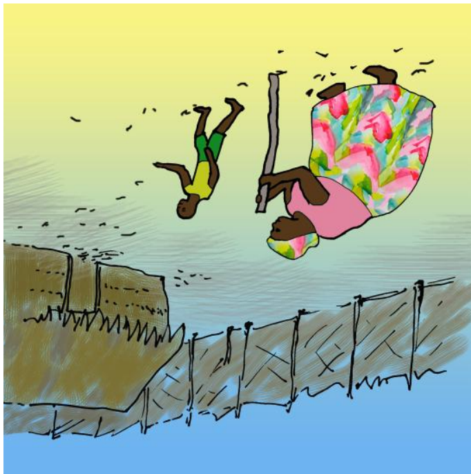
Mubanyonya Iyolho Iyolho eriha eka.