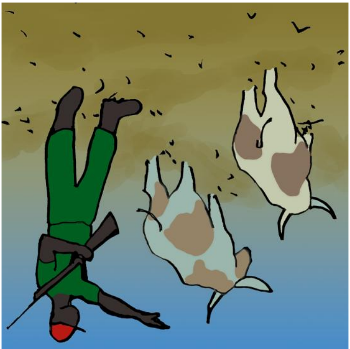
Mubaheka esy'ande syosi.