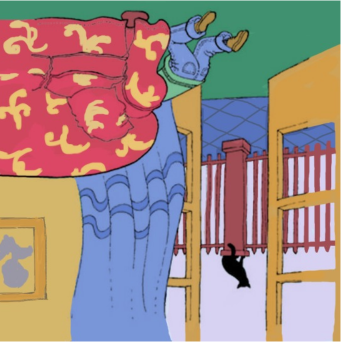
kali enyuma y'ekithumbi?