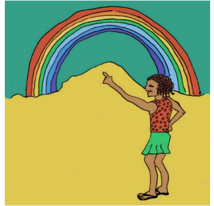
Mi si wahn rienbuo.