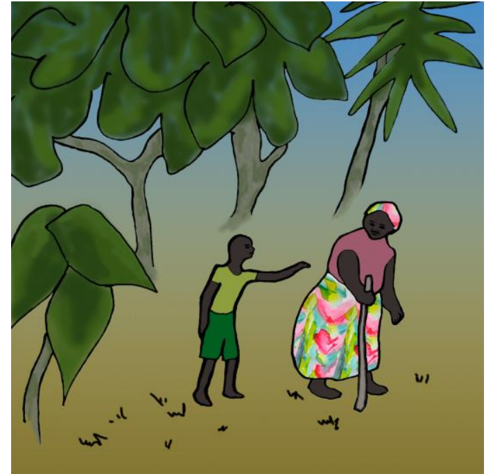
Lè danje a fini Tingi ak grann li leve.