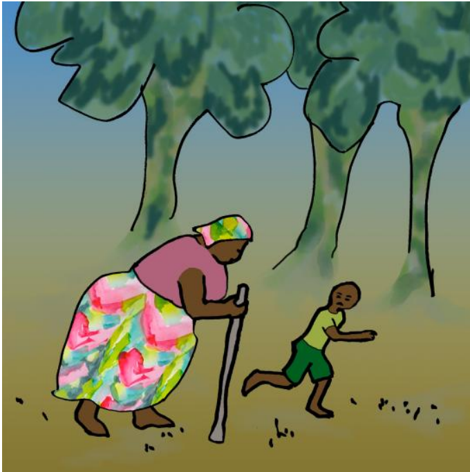
Tingi ak grann li sove al kache.