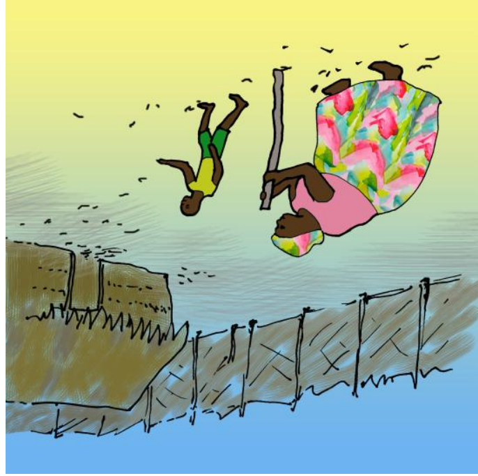
Yo tounen lakay yo san yo pa fè bwi.