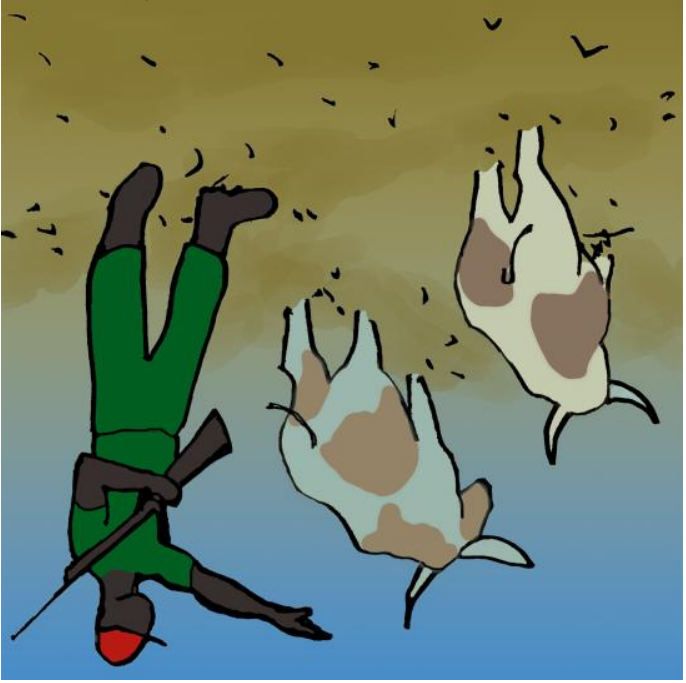
Yo pran tout bèf yo.