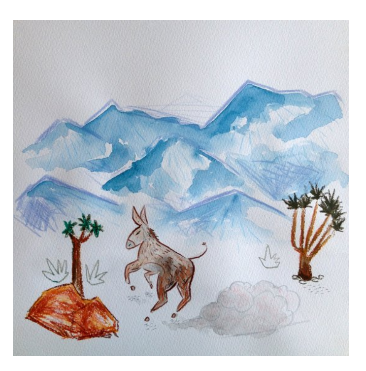
Donkey finally knew what to do.

But when they saw the baby, everyone jumped back in shock. "A donkey?!"