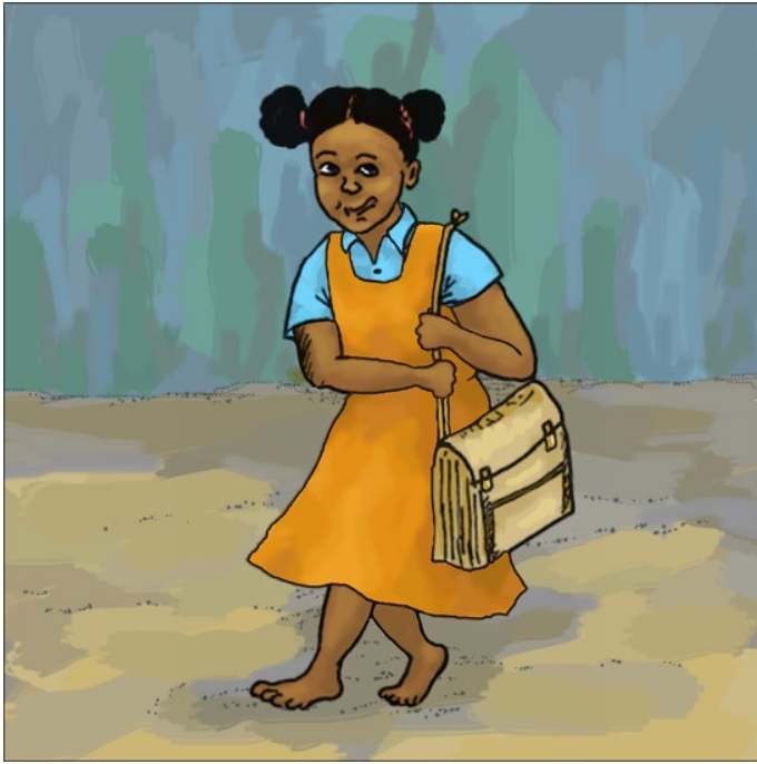
Icola ici cikulu.