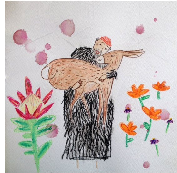
Indoda yamthatha umbongolo

Now, if the child had stayed that same, small size, everything might have been different. But the donkey child grew and grew until he could no longer fit on his mother's back. And no matter how hard he tried, he could not behave like a human being. His mother was often tired and frustrated. Sometimes she made him do work meant for animals.