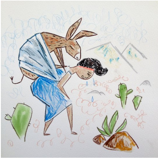
Umntwana oyimbongolo wakhula