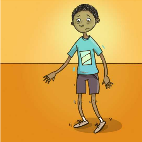
Rahim starts to feel sick.